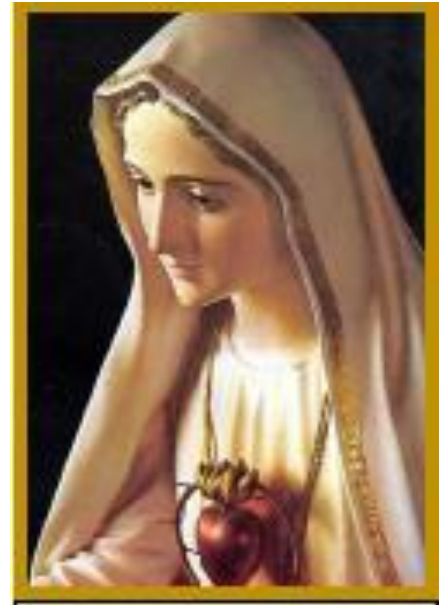
Our Lady of Fatima and her Immaculate Heart

Fatima is in central Portugal, northeast of Lisbon. The nation is traditionally Catholic. Its King and one son were assassinated in 1908 and after another son became King, he was overthrown by a revolution of the very anti-Catholic, anti-clerical Freemasons in 1910. Once in power, the Freemasons passed in 1911 an anti-religious law; their leader's goal was to eliminate Catholicism within two generations. As the apparitions began, the devastating First World War was about to enter its third year elsewhere in Europe but Portuguese soldiers were about to become involved. Such was the internal political climate in Portugal prior to 1916.