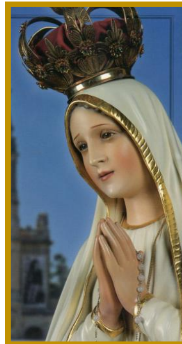
Our Lady of Fatima Statue

Our Lady said on August 19 th : Pray, pray a great deal and make sacrifices for many souls go to Hell because they have no one to make sacrifices and to pray for them.