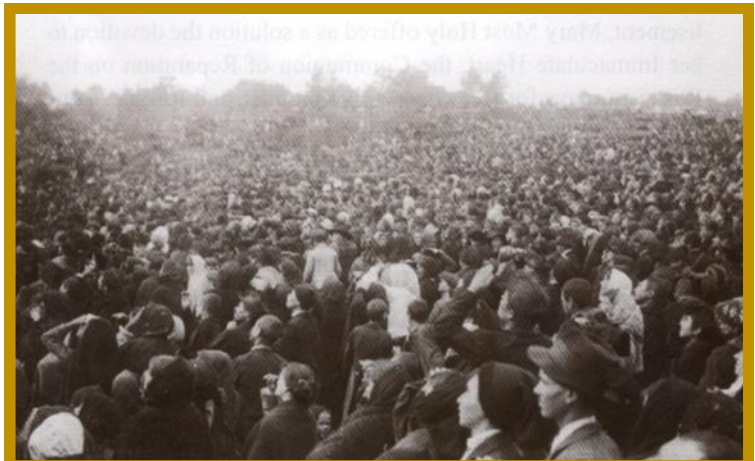
October 13, 1917 crowd looking toward the sun

As Our Lady was about to leave, she pointed to the sun. The rain had stopped, the clouds parted, and the sun began to whirl in the sky, scattering rays of multicolored light, lighting up the countryside. The sun whirled for three minutes, stopped, and resumed a second and third time, lasting a total of twelve minutes. The sun spun faster each time and at the end, seemed to tear itself from the sky and plunge toward earth. Many thought that it was the end of the world!