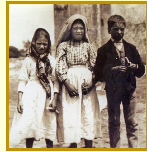
The children after July apparition

In addition to spreading Communism, Russia would legalize abortion in 1920, becoming the first modern state to formally support abortion. This error initially spread in 1922 in the newly created USSR and later, spread worldwide into today's great World War on the Unborn which now kills over 70 million unborn children each year, more than all the deaths in World War II. In 1921 Russia's Communism spread to China and quickly led to its long and deadly civil war. China today is the largest Communist nation with 1.4 billion people and the largest number of abortions (18 million/year). Today, ris-