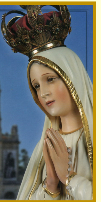
Our Lady of Fatima Statue

Note: The Popes made many Consecrations to Mary's Immaculate Heart including personal consecrations, and have encouraged the faithful to do likewise. The Popes also honored Mary with encyclicals and decrees, including the declaration of two Marian Years and the Dogma of her Assumption into Heaven. There is historical evidence that these papal actions have positively impacted world affairs, such as helping bring to an end World War II, the Korean War and the Cold War.