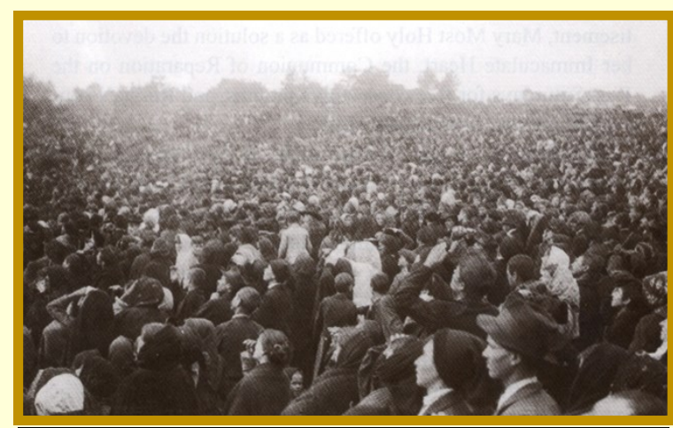
October 13, 1917 crowd looking toward the sun

Then on June 13, 1929, Our Lady requested the Consecration of Russia. The timing of this request is notable since events were about to unfold in the immediate years ahead in Germany, the Soviet Union and the Far East that would lead to a war greater than World War I. Stalin's policies would prove catastrophic for the USSR with his 1930's mass relocations of 60 million peasants, with 6 million people sent to forced labor camps, with 8.5 million deaths due to a major famine made much worse by his policies, and with his murderous purges of any suspected opponents including top military leaders. Stalin's severe persecutions of the Church would continue through the 1930s. In Germany, Hitler would become Chancellor in 1933, then Dictator, rearming Germany, initiating the Holocaust, and with Stalin's connivance in 1939, expanding World War II by invading Poland. Under Stalin's leadership, the Soviet Union will experience an enormous death toll of up to 25 million in