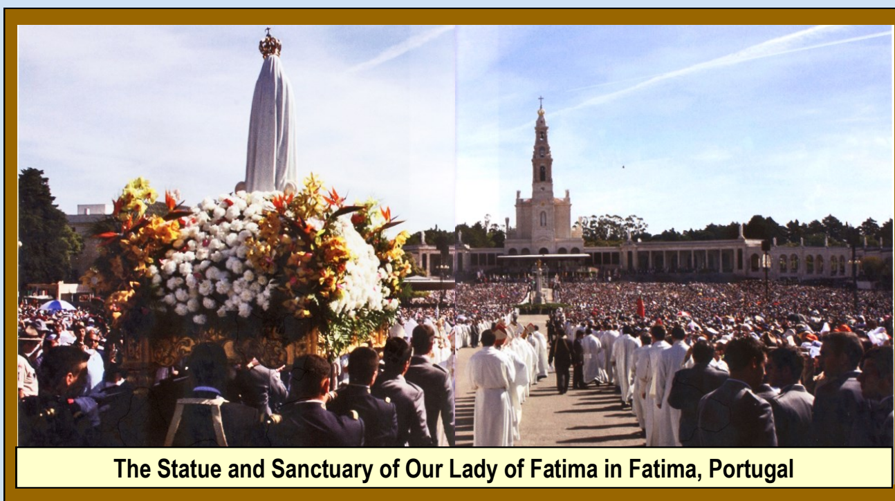
The Statue and Sanctuary of Our Lady of Fatima in Fatima, Portugal