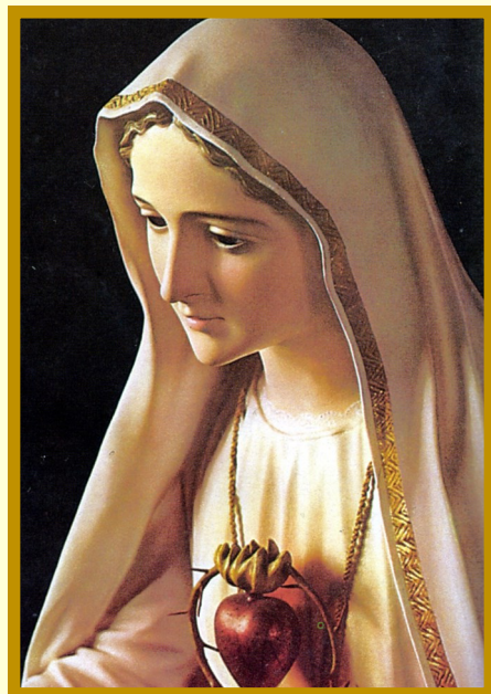
Our Lady of Fatima and her Immaculate Heart

The children also endured much disbelief from their families, friends and pastor, and were ridiculed and even spat upon by some neighbors. Lucia was sternly treated by her strict, unbelieving mother. Yet, despite an overwhelming and intimidating situation, the children did not change their testimony about the apparitions.