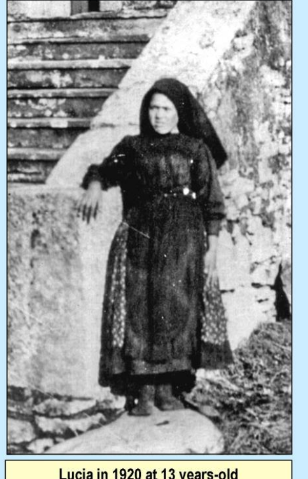
Lucia in 1920 at 13 years-old

In 1925 Lucia entered the Order of St. Dorothy at Tuy, Spain. Later when her long term desire to live in seclusion and solitude re-awakened, she received permission to transfer to the Discalced Carmelites near Coimbra, Portugal. Sister Lucia remained in a convent until her death at age 97 in February 13, 2005