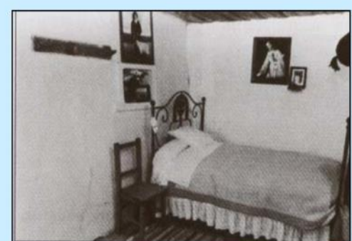
The bedroom where Francisco died

Jacinta also willingly accepted her suffering. She still vividly remembered the suffering souls in Hell in the vision of July 13, 1917 and was willing to endure much suffering to save souls. Jacinta's health deteriorated throughout 1919 and she was moved to a hospital in Lisbon where she died on February 20, 1920.