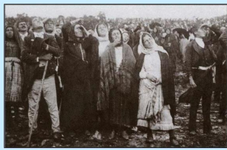
Pilgrims looking up toward the miracle of the sun

As Our Lady was about to leave, she pointed to the sun and Lucia cried out, "Look at the sun!" The rain had stopped and the black clouds parted and the sun began to whirl in the sky, scattering rays of multi-colored light and lighting up the entire countryside.