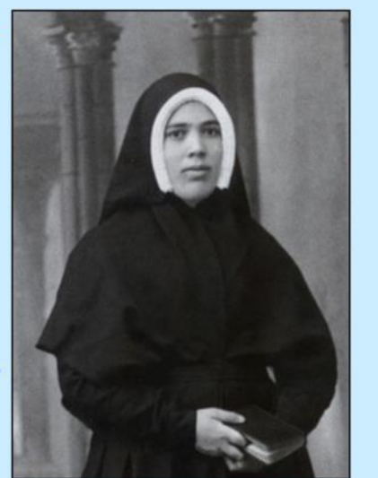
Sister Lucia as a Dorothean Sister

Our Lady then spoke: "Look my daughter, at my Heart, surrounded with thorns with which ungrateful men pierce me at every moment by their blasphemies and ingratitude. You at least try to console me and say that I promise to assist at the hour of death, with the graces necessary for salvation, all those who, on the first Saturday of five consecutive months, shall confess [their sins], receive Holy Communion, recite five decades of the Rosary, and keep me company for fifteen minutes while meditating on the fifteen mysteries of the Rosary, with the intention of making reparation to me."