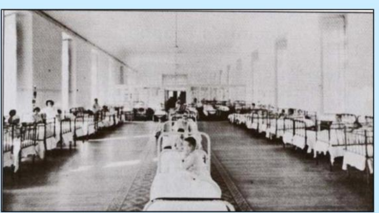
The Hospital in Lisbon where Jacinta died

In December of 1918, Francisco became sick with Spanish influenza. Soon afterwards, Jacinta also became ill with influenza and later pleurisy. Francisco willingly accepted his suffering and offered it for the conversion of lost souls. He died on April 4, 1919. He had grown so much spiritually since the first apparition.