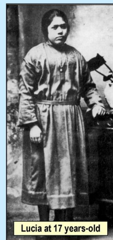
Lucia at 17 years-old

Historical Context - Germany Begins March to World War II: The request for the Communion of Reparation on the First Saturdays occurred on December 10, 1925, which was about two months before Hitler consolidated his leadership position in the Nazi Party at meeting of sixty of its leaders on February 14, 1926. Historian Ian Kershaw wrote that at the meeting "Hitler had reasserted his authority" and with subsequent actions and a directive it led to "the complete establishment of Hitler's supreme mastery over the party."