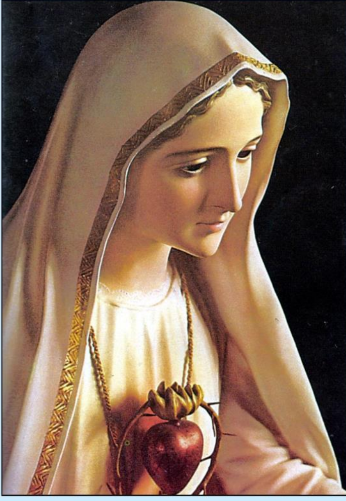
Our Lady of Fatima and her Immaculate Heart

And like the first apparition, Our Lady opened her hands and the immense light surrounded the children who were overwhelmed in their spirits by being immersed in God's presence and goodness. In her memoirs Lucia wrote: "Jacinta and Francisco seemed to be part of the light which rose toward Heaven, and I in that which was poured out on the earth. In front of the palm of Our Lady's right hand was a heart encircled with thorns which pierced it. We understood that this was the Immaculate Heart of Mary, outraged by the sins of humanity, and seeking reparation." Our Lady then rose into the sky as the crowd saw the little cloud of light drift away and that the leaves of the shrub were bent as if Our Lady's garments had trailed over them.