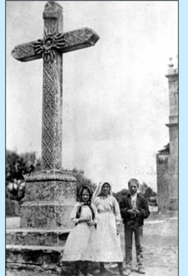
The 3 children at their parish church

Meanwhile back on August 13 th at the apparition site, a crowd of around 15,000 had gathered in the field. When they heard that the children were kidnapped by the authorities, the crowd was becoming angry about the news, and then suddenly there was a loud, frightful clap of thunder and a blinding flash of light and then a small, brilliant white cloud descend to where the children met Our Lady in the previous apparitions. The cloud remained for a few minutes and then rose to the heavens. A supernatural light remained. There was also a heavenly fragrance of flowers that people experienced. Our Lady had made her presence known even though the children could not be there.