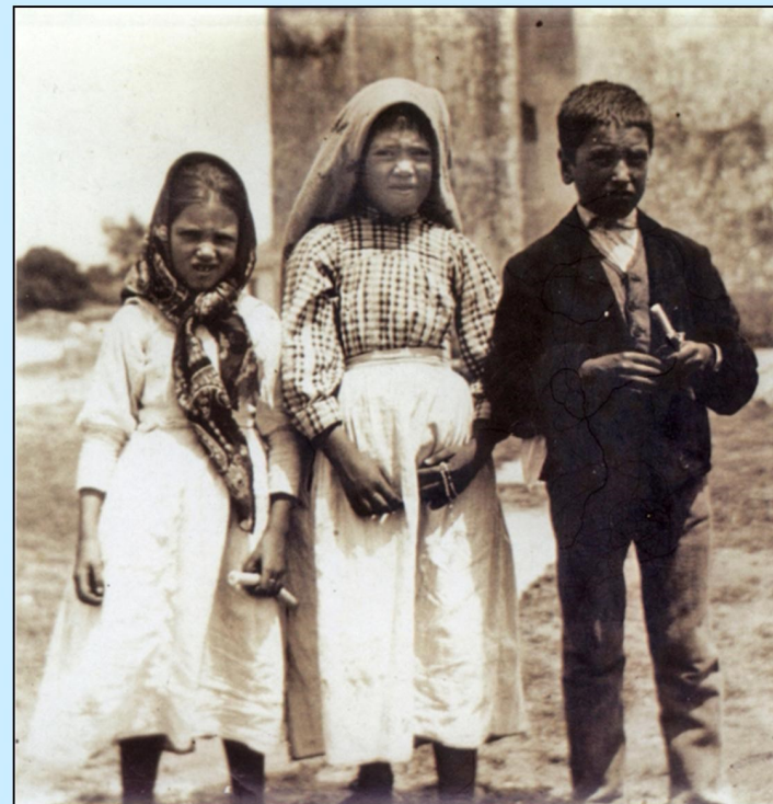
The children after the July apparition

"Sacrifice yourselves for sinners and say often, especially when you make some sacrifice, 'O my Jesus, this is for love of You, for the conversion of sinners, and in reparation for the offenses committed against the Immaculate Heart of Mary.'"