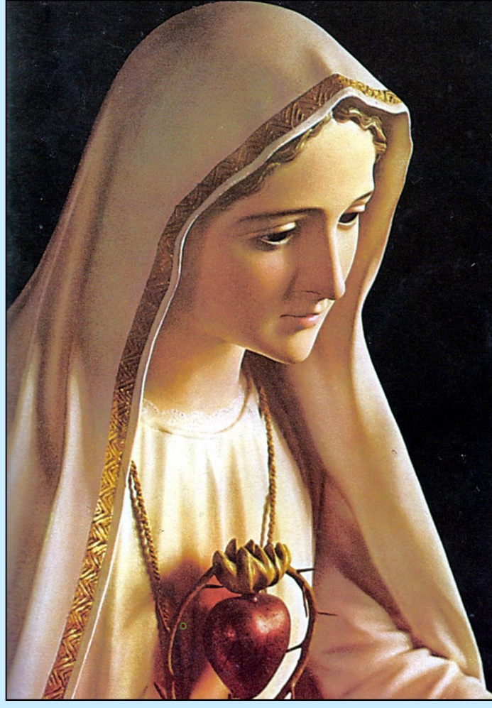
Our Lady of Fatima and her Immaculate Heart

And like the first apparition, Our Lady opened her hands and the immense light surrounded the children who were overwhelmed in their spirits by being immersed in God's presence and goodness. In her memoirs Lucia wrote: "Jacinta and Francisco seemed to be part of the light which rose toward Heaven, and I in that which was poured out on the earth. In front of the palm of Our Lady's right hand was a heart encircled with thorns which pierced it. We understood that this was the Immaculate Heart of Mary, outraged by the sins of humanity, and seeking reparation." Our Lady then rose into the sky as the crowd saw the little cloud of light drift away and that the leaves of the shrub were bent as if Our Lady's garments had trailed over them.